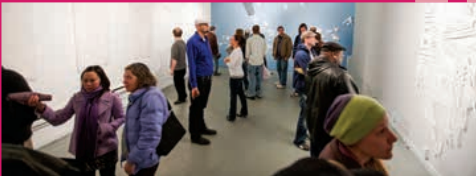
GALLERY CRAWL IN THE CULTURAL DISTRICT 24

tickets / showtimes / info : CULTURALDISTRICT.ORG