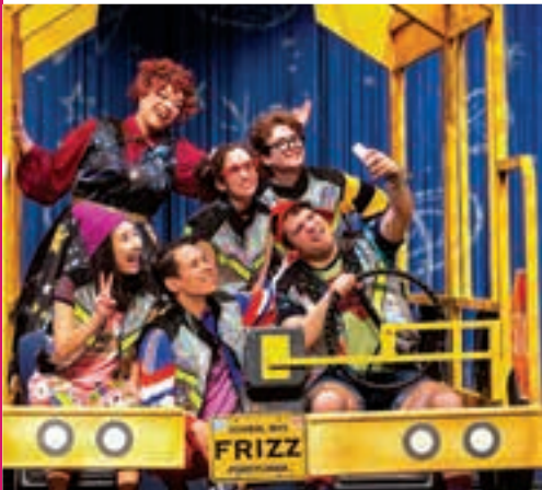
THE MAGIC SCHOOL BUS: LOST IN THE SOLAR SYSTEM OPENS JANUARY

Performed at satellite locations Jan. 8–12