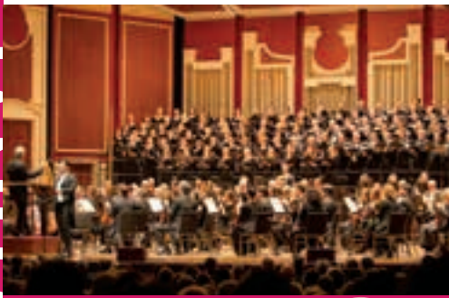
BEETHOVEN'S "FIDELIO" OPENS JANUARY 24