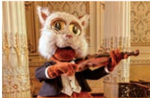
LOVE IS IN THE AIR

Pittsburgh Cultural Trust Trust Arts Education Center / 807 Liberty Ave. 1-4 p.m. / $20