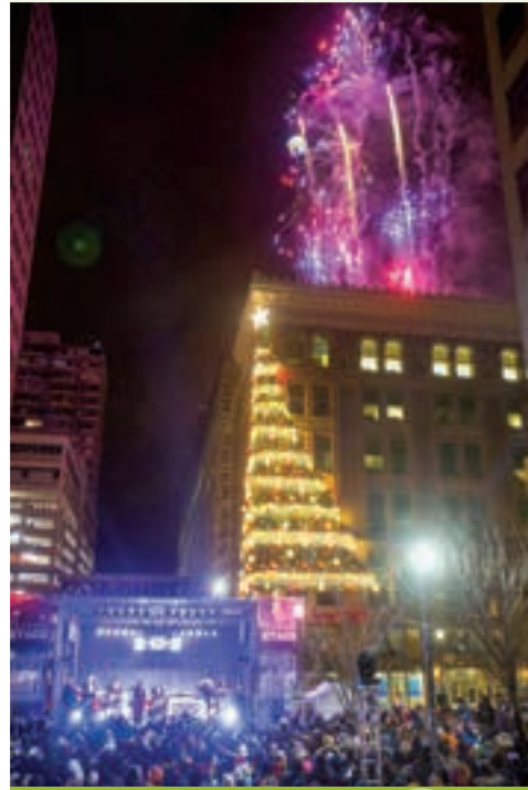
HIGHMARK FIRST NIGHT PITTSBURGH 2020

Admission Buttons $10 (kids 5 and under FREE)