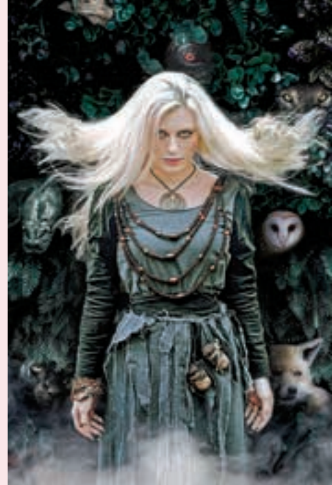
HANDEL'S ALCINA OPENS JANUARY 25

Pittsburgh Cultural Trust Benedum Center / Tickets start at $86.25 ■ Also Jan. 25