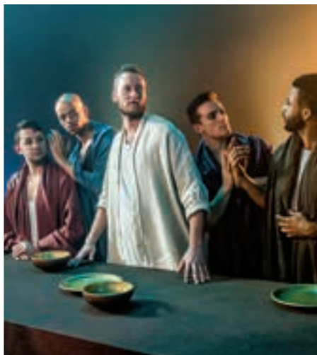
JESUS CHRIST SUPERSTAR OPENS DECEMBER